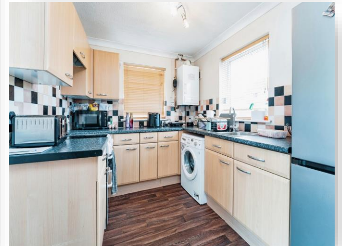
Mountbatten Drive, Leverington Wisbech PE13 5AF