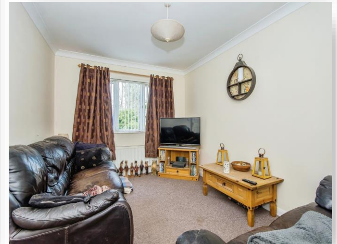
New Drove, Wisbech PE13 2RZ