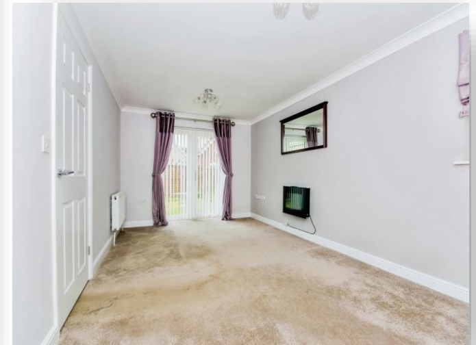
Winceby Close, Wisbech PE14 0TG