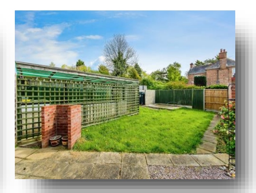
High Rd