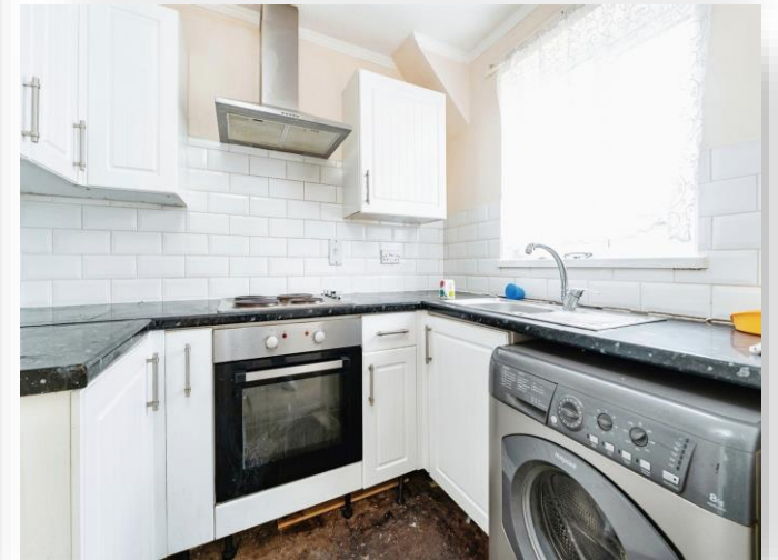
Church Mews, Wisbech PE13 1HL