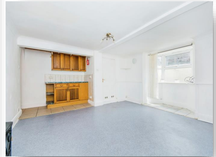
Basement Flat St. Augustines Road, Wisbech PE13 3AH