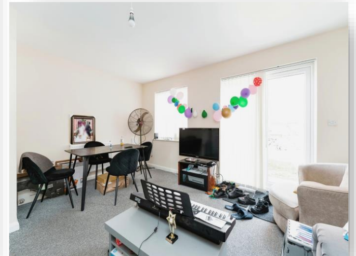
Fenmen Place, Wisbech PE13 3FA