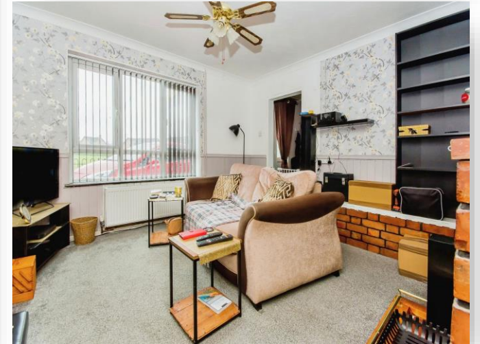
Coldhorn Crescent, WISBECH PE13 3HA