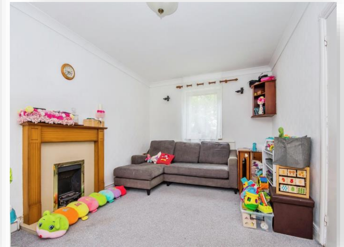
Weasenham Lane, WISBECH PE13 2RY