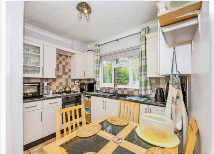
Harecroft Road, Wisbech PE13 1RL