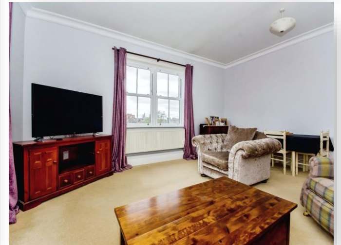
Colville House, Old Convent Fields, Wisbech PE13 1HT