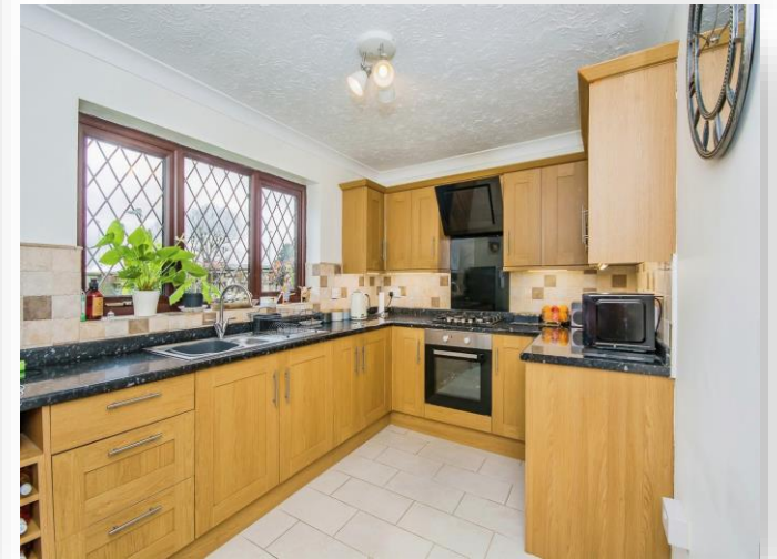
Kestrel Drive, Wisbech PE13 2TS