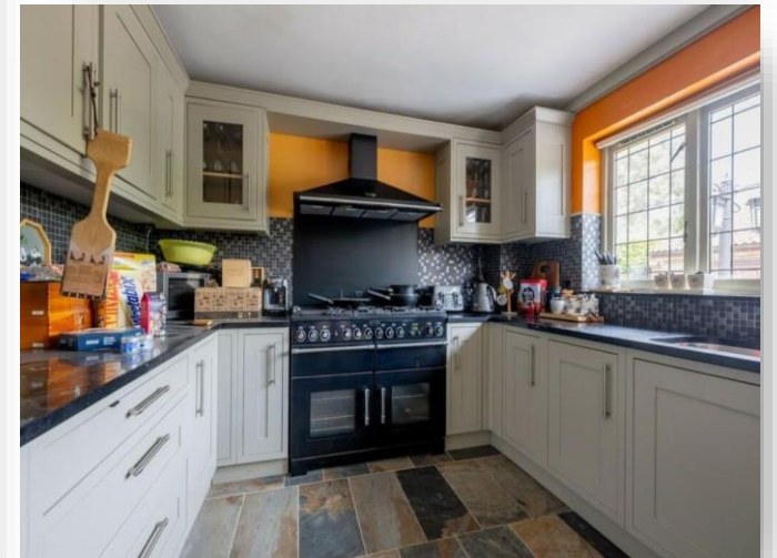
Fridaybridge Road, Elm Wisbech PE14 0AU