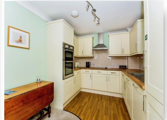
Edina Court, Harecroft Road, Wisbech PE13 1RL