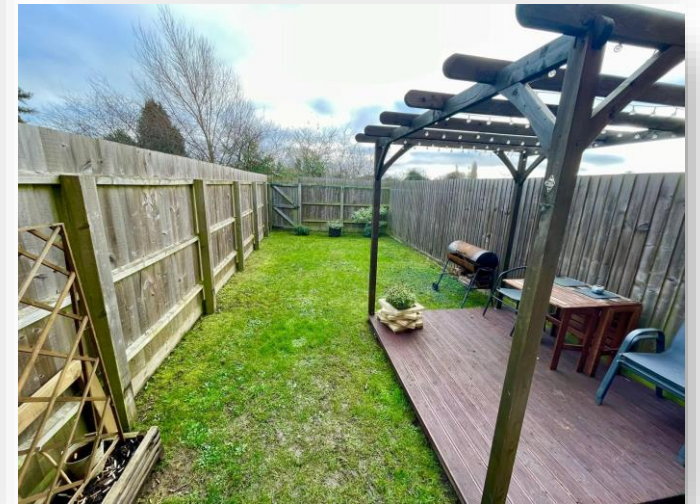
Mikanda Close, Wisbech PE13 2TU