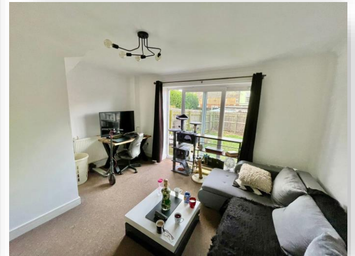
Mikanda Close, WISBECH PE13 2TU