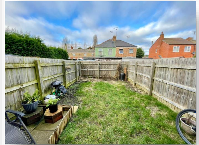
Mikanda Close, WISBECH PE13 2TU