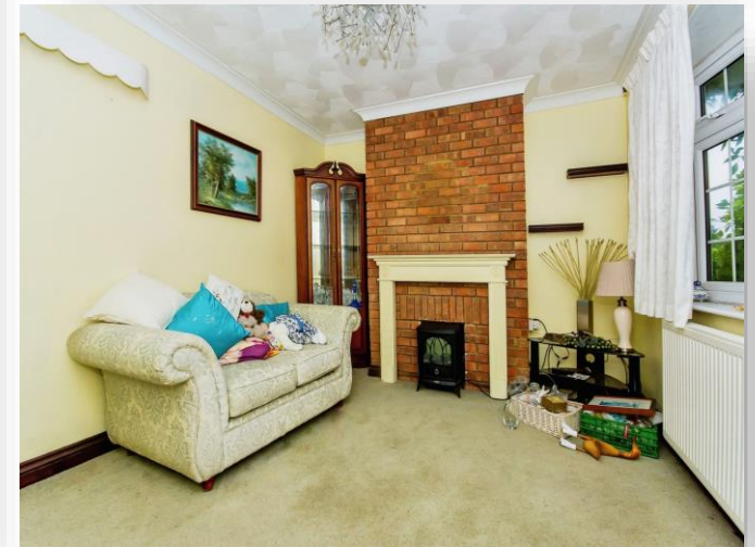
March Road, Friday Bridge Wisbech PE14 0HA