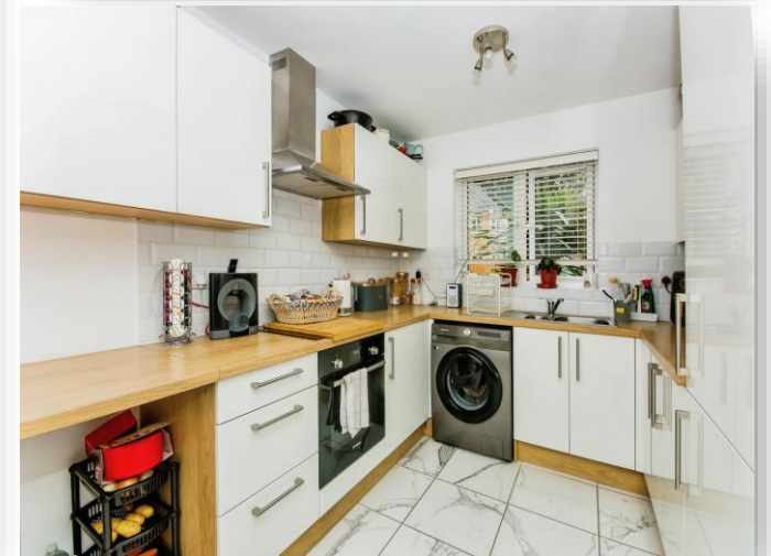
Fenmen Place, WISBECH PE13 3FA