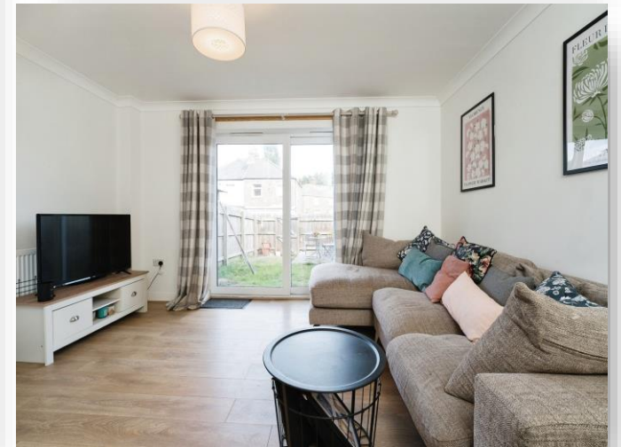
Mikanda Close, Wisbech PE13 2TU