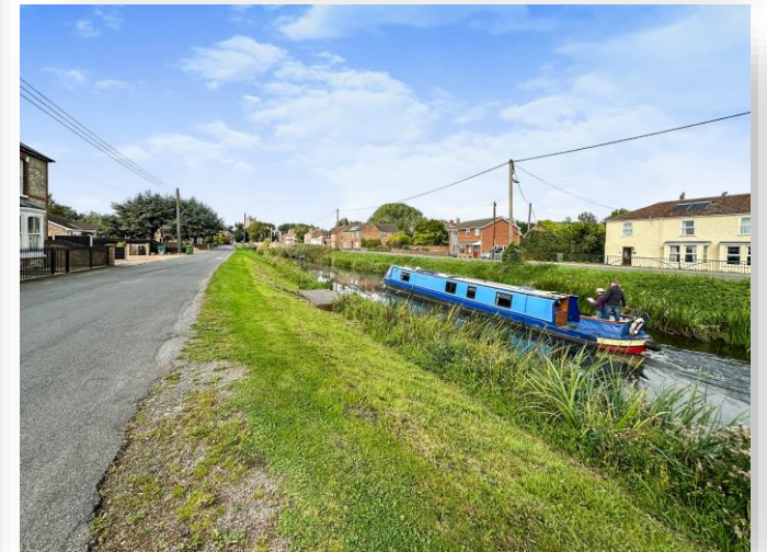
Well Creek Road, Outwell WISBECH PE14 8SD