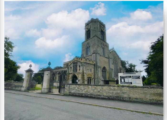
Plot 1 Stone House Road, Upwell Wisbech PE14 9EA