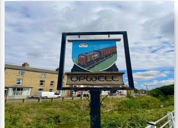
Plot 1 Stone House Road, Upwell Wisbech PE14 9EA