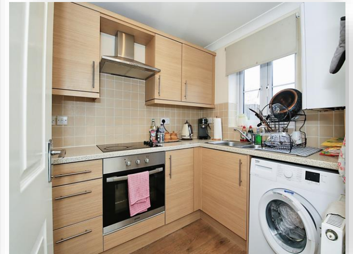
Harrys Way, Wisbech PE13 2TX