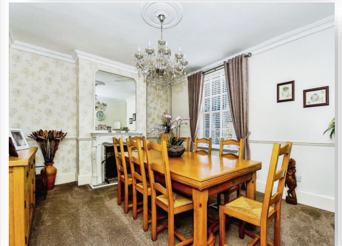
Elm Road, Wisbech PE13 2TB