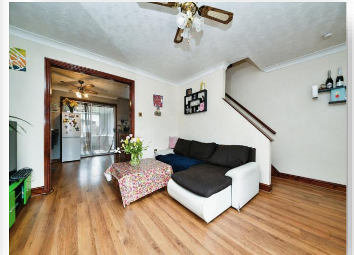
Prince Of Wales Close, Wisbech PE13 3HN