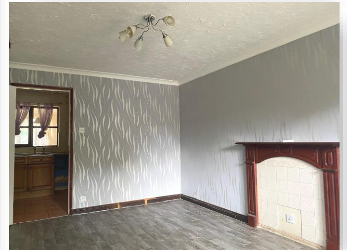
Payne Avenue, Wisbech PE13 3HS