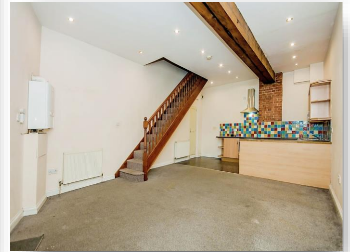
Albion Place, Wisbech PE13 1AL