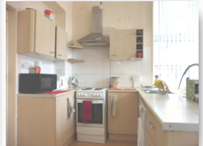
Turnpike Court, Norwich Road, Wisbech PE13 3LX