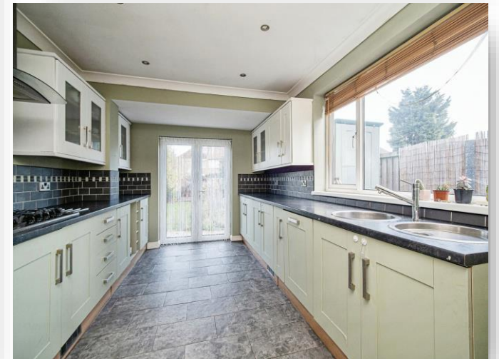
Spring Gardens, Anlaby Common HU4 7QL