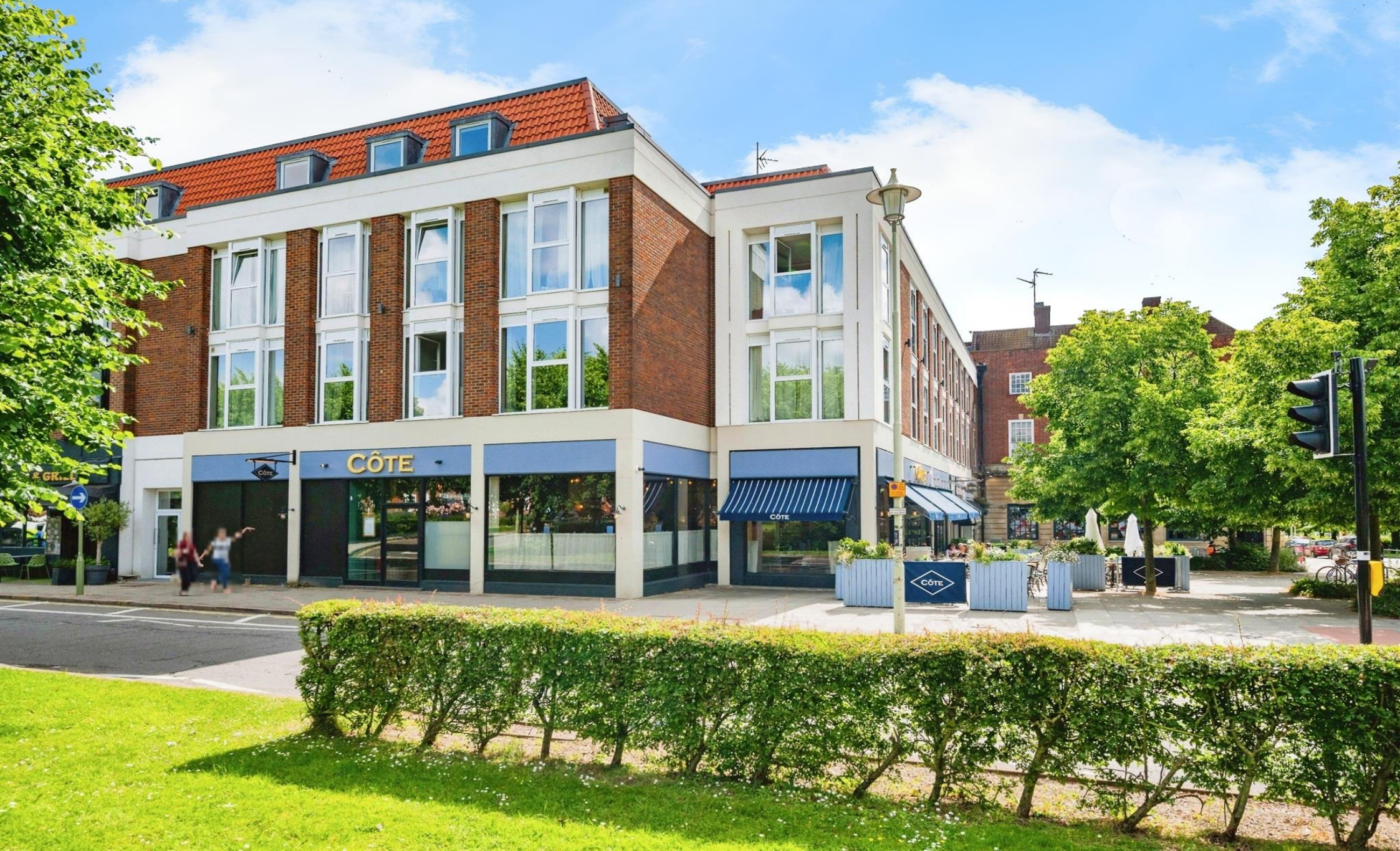
Fountain House Parkway, Welwyn Garden City AL8 6DS