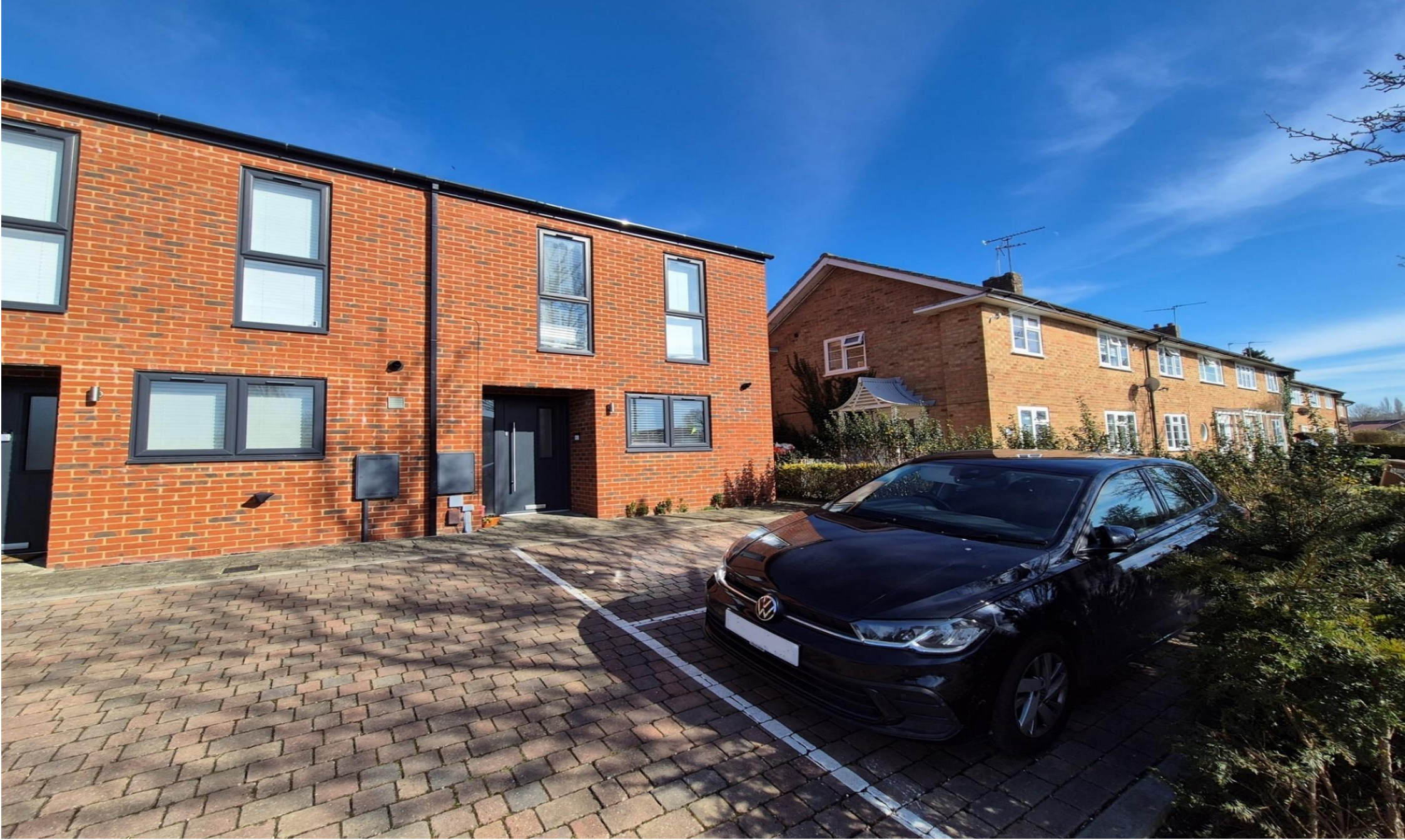
Hall Grove, Welwyn Garden City AL7 4PJ