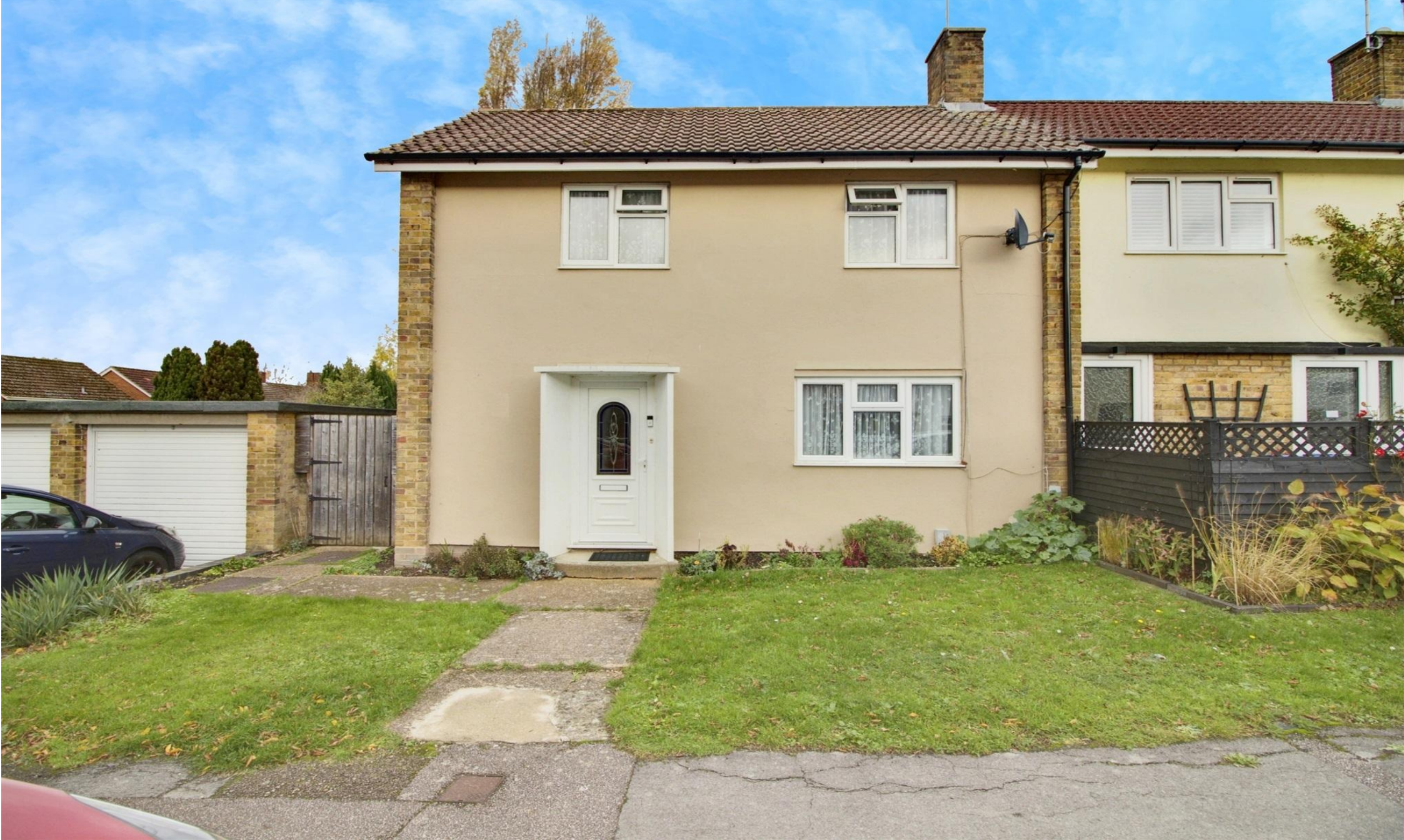
Little Thistle, Welwyn Garden City AL7 4AE