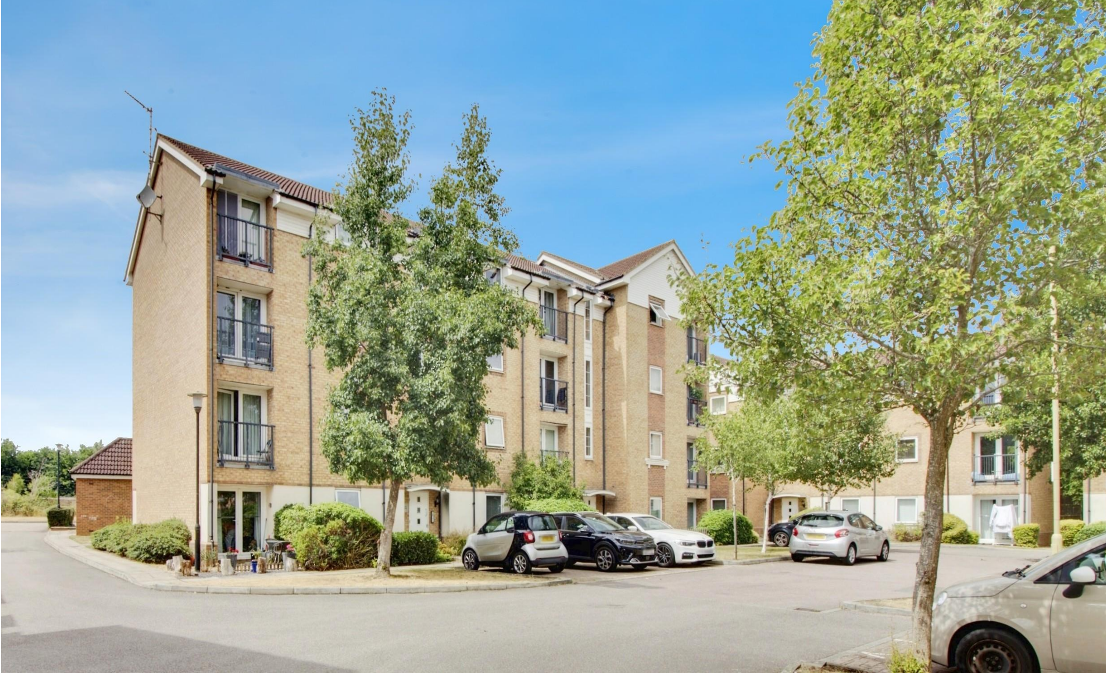
Chequers Field, WELWYN GARDEN CITY AL7 4TX