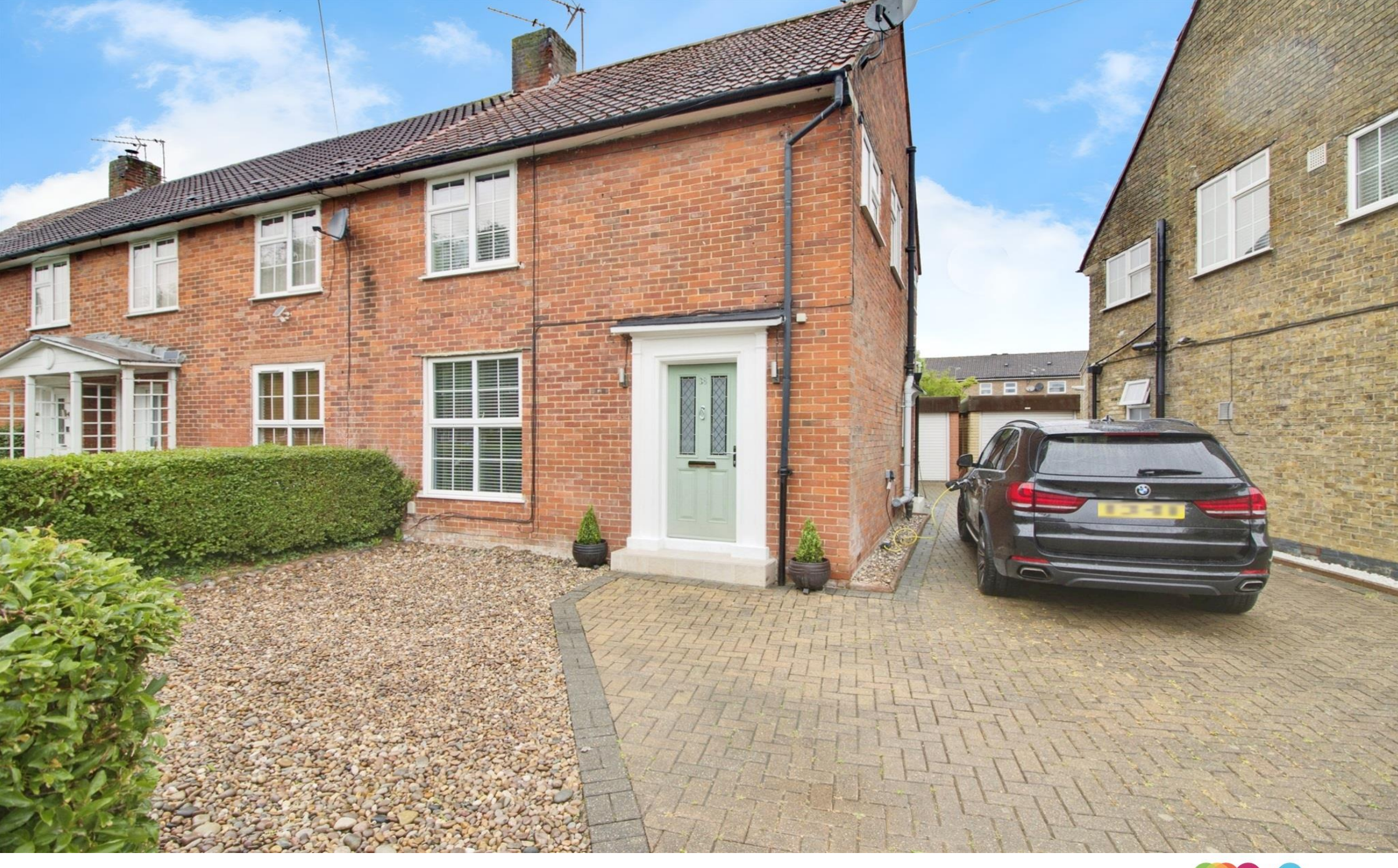
Beechfield Road, Welwyn Garden City AL7 3RF