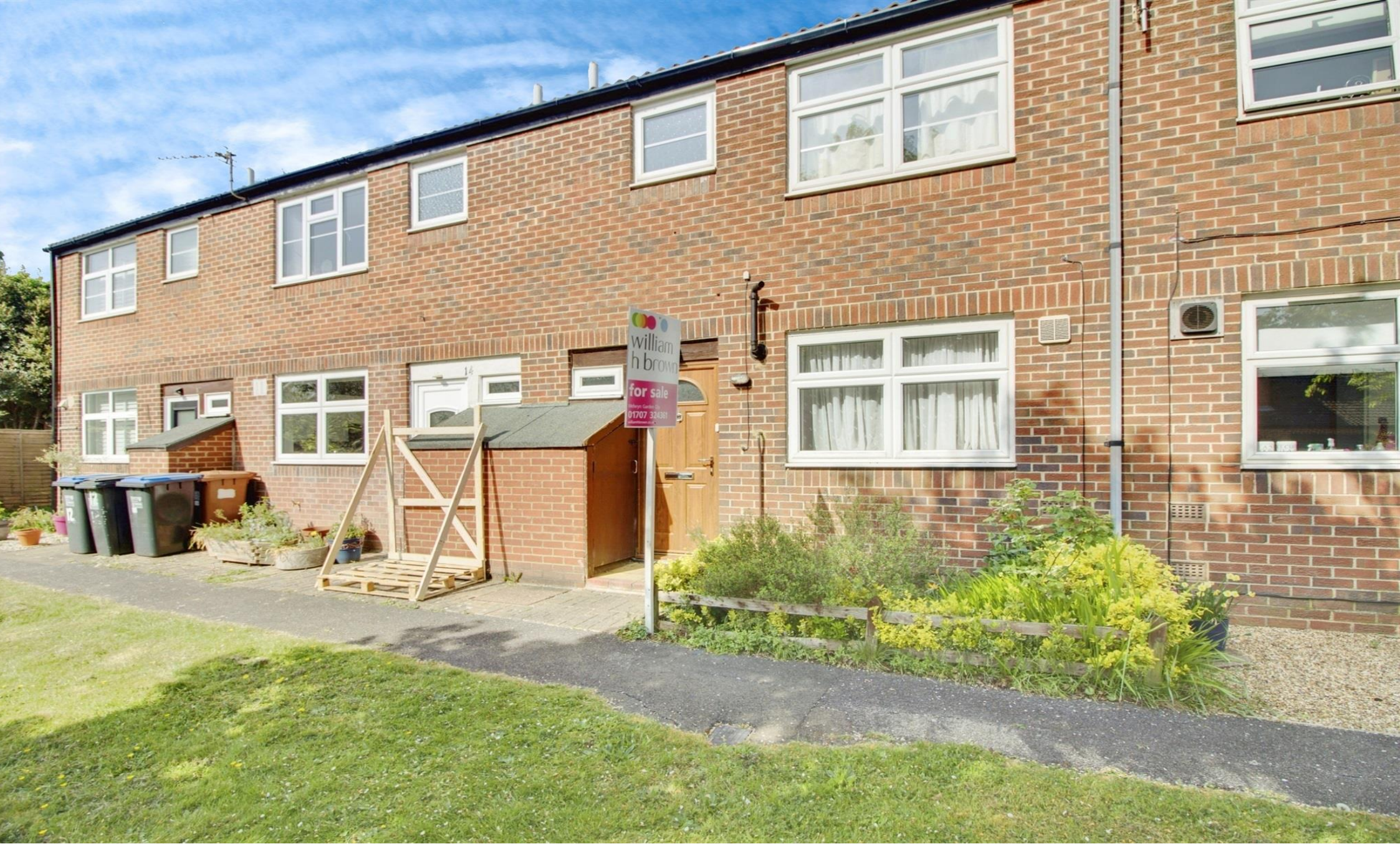
Guessens Grove, Welwyn Garden City AL8 6RF