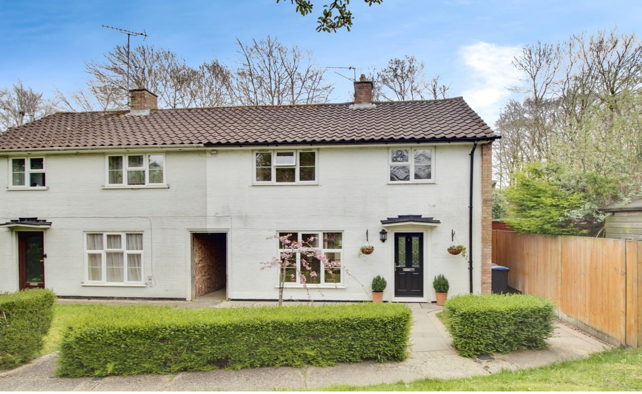
Picketts, Welwyn Garden City AL8 7HJ