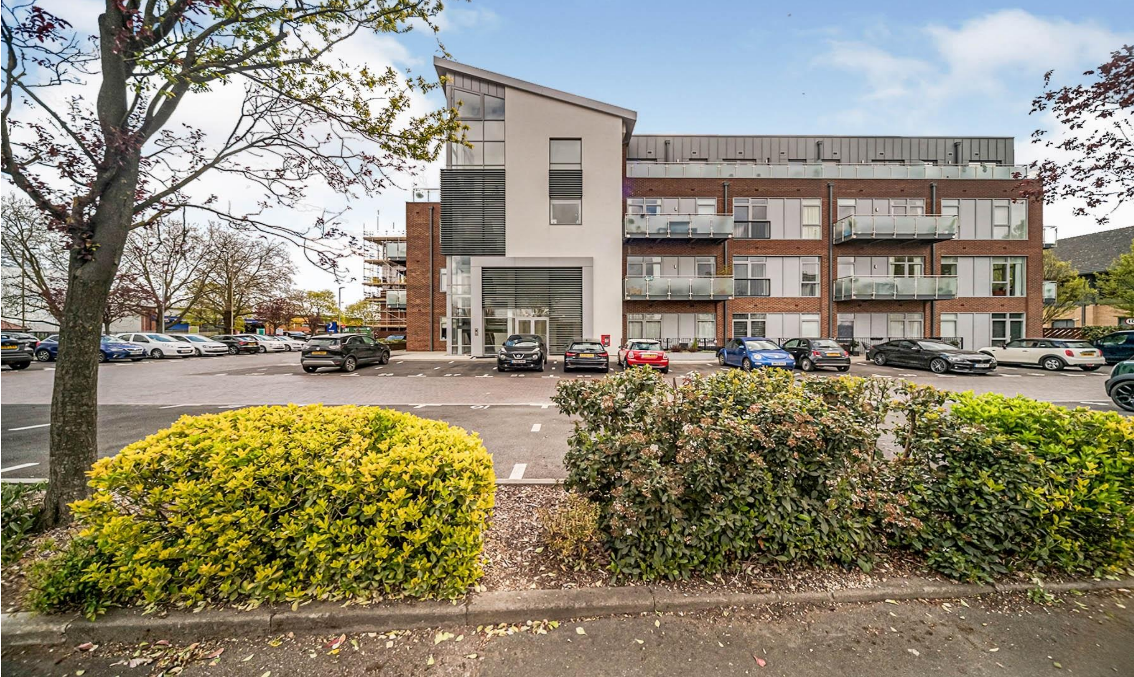
Mercury House Broadwater Road, WELWYN GARDEN CITY AL7 3FB