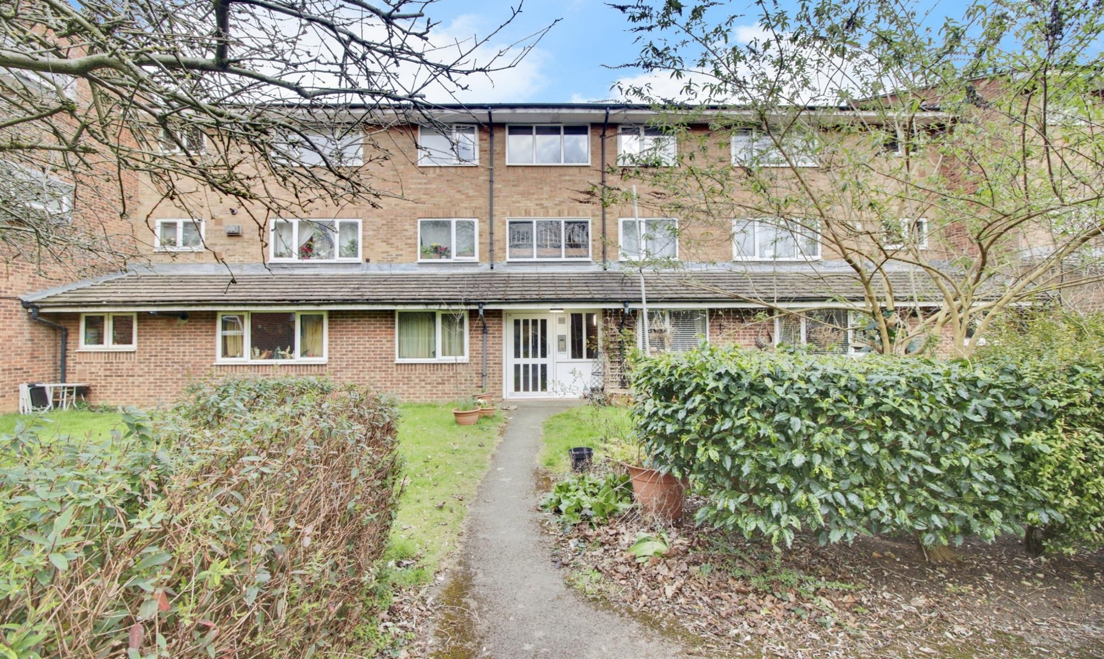
Russett House, Russett Wood, Welwyn Garden City AL7 2HQ