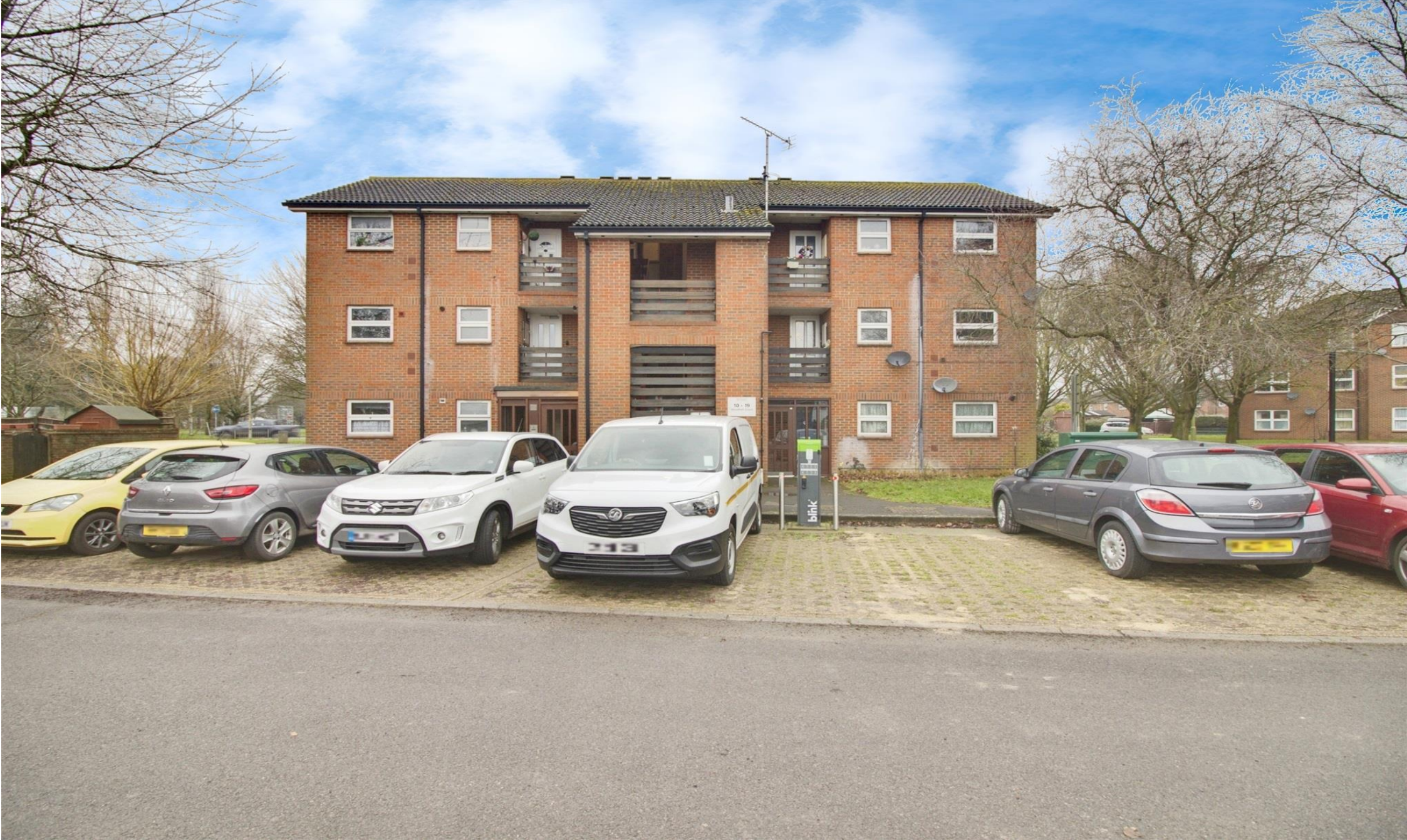
Woodhall Court, Welwyn Garden City AL7 3TD