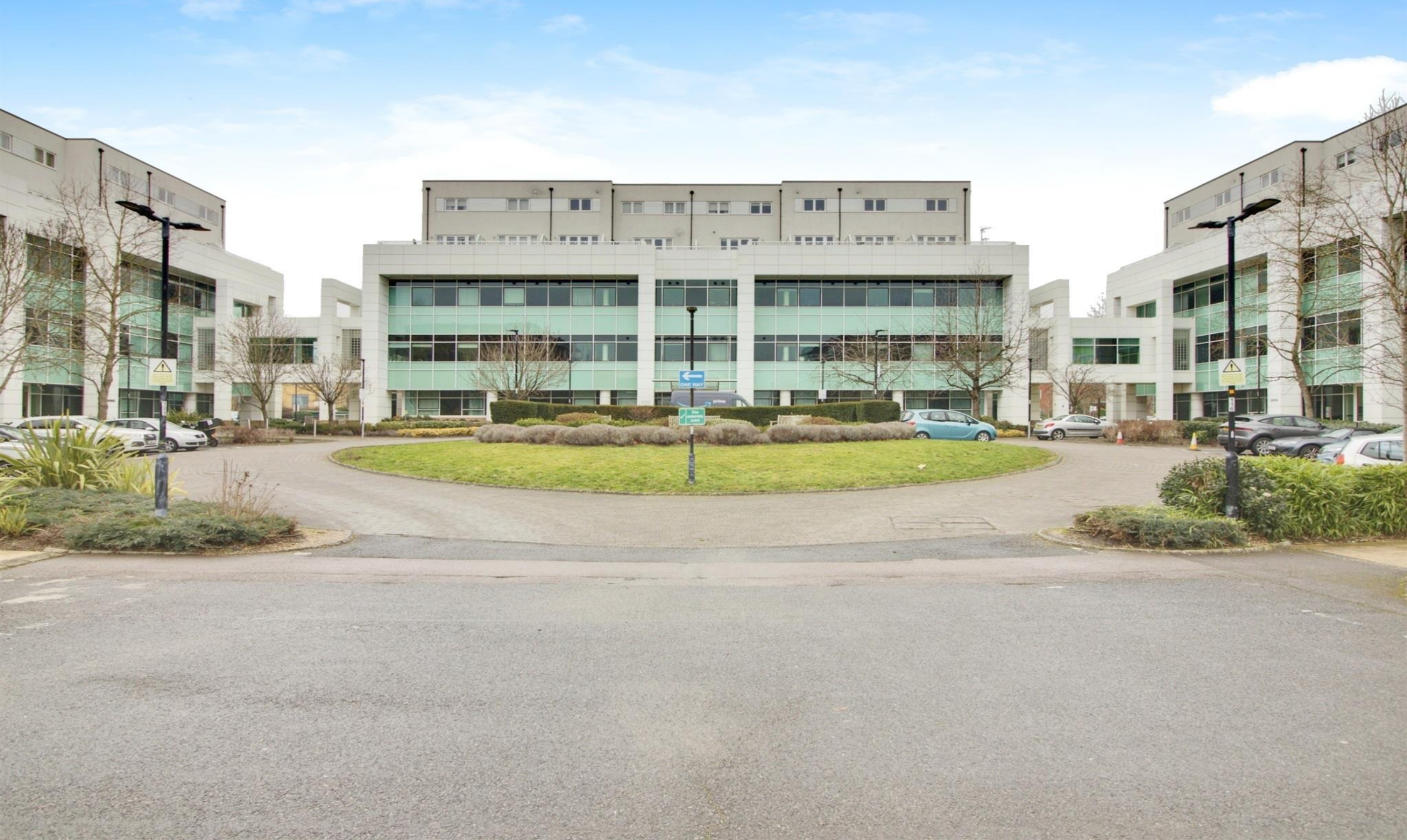
Empire House Bessemer Road, Welwyn Garden City AL7 1FY