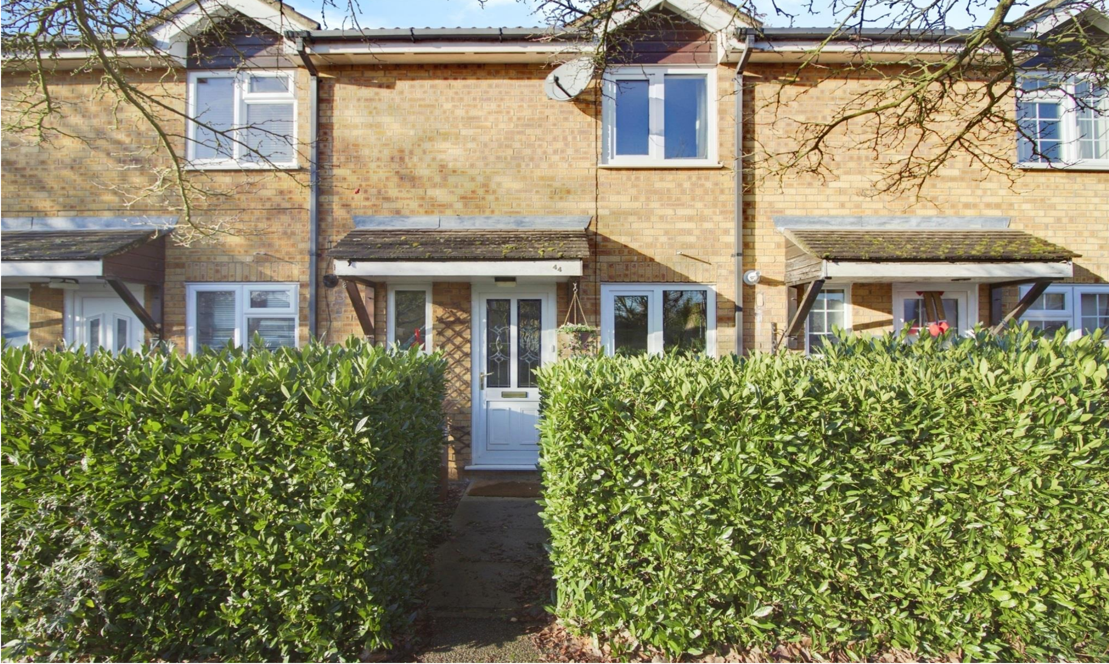
Wellington Drive, Welwyn Garden City AL7 2NB