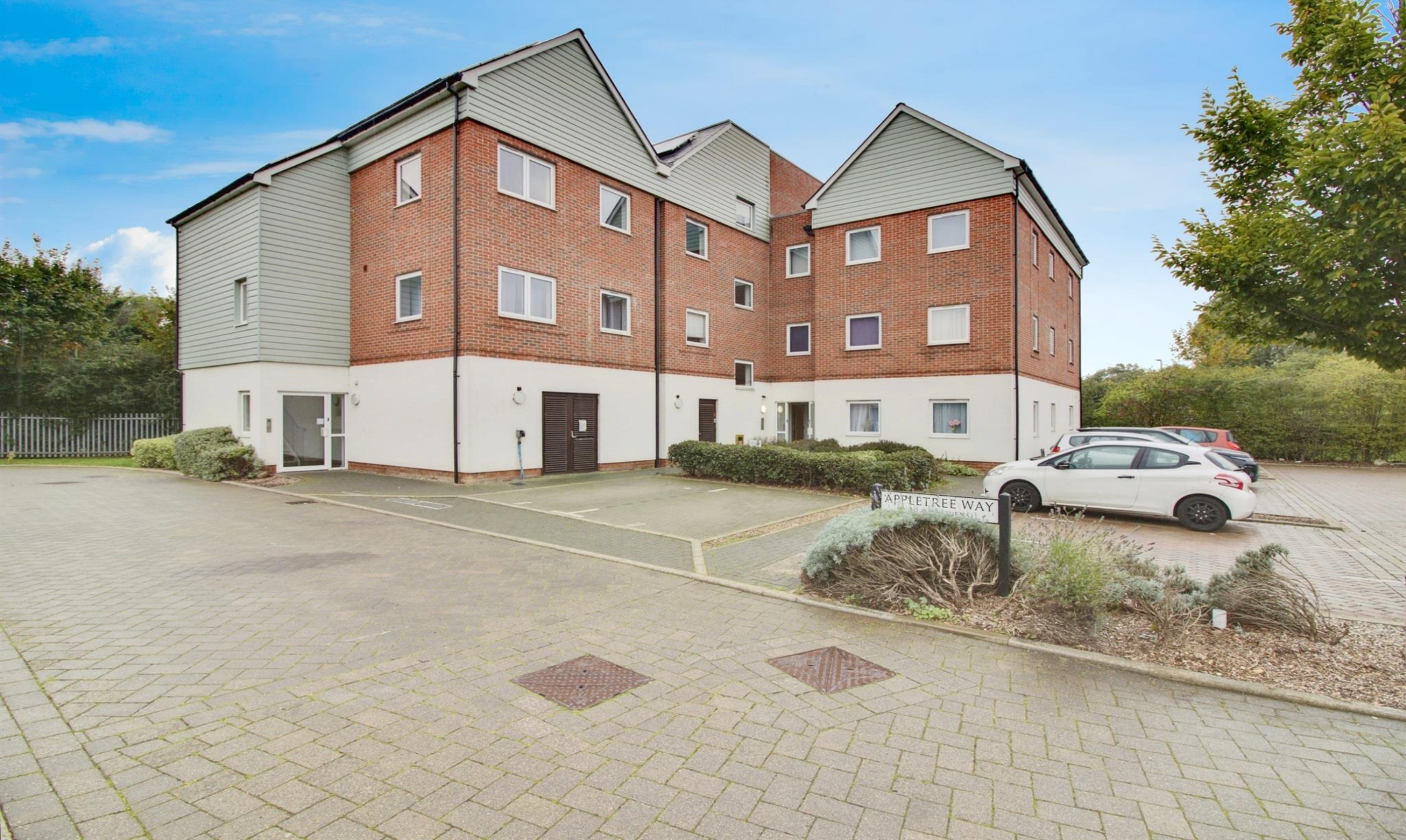
Appletree Way, Welwyn Garden City AL7 2FE