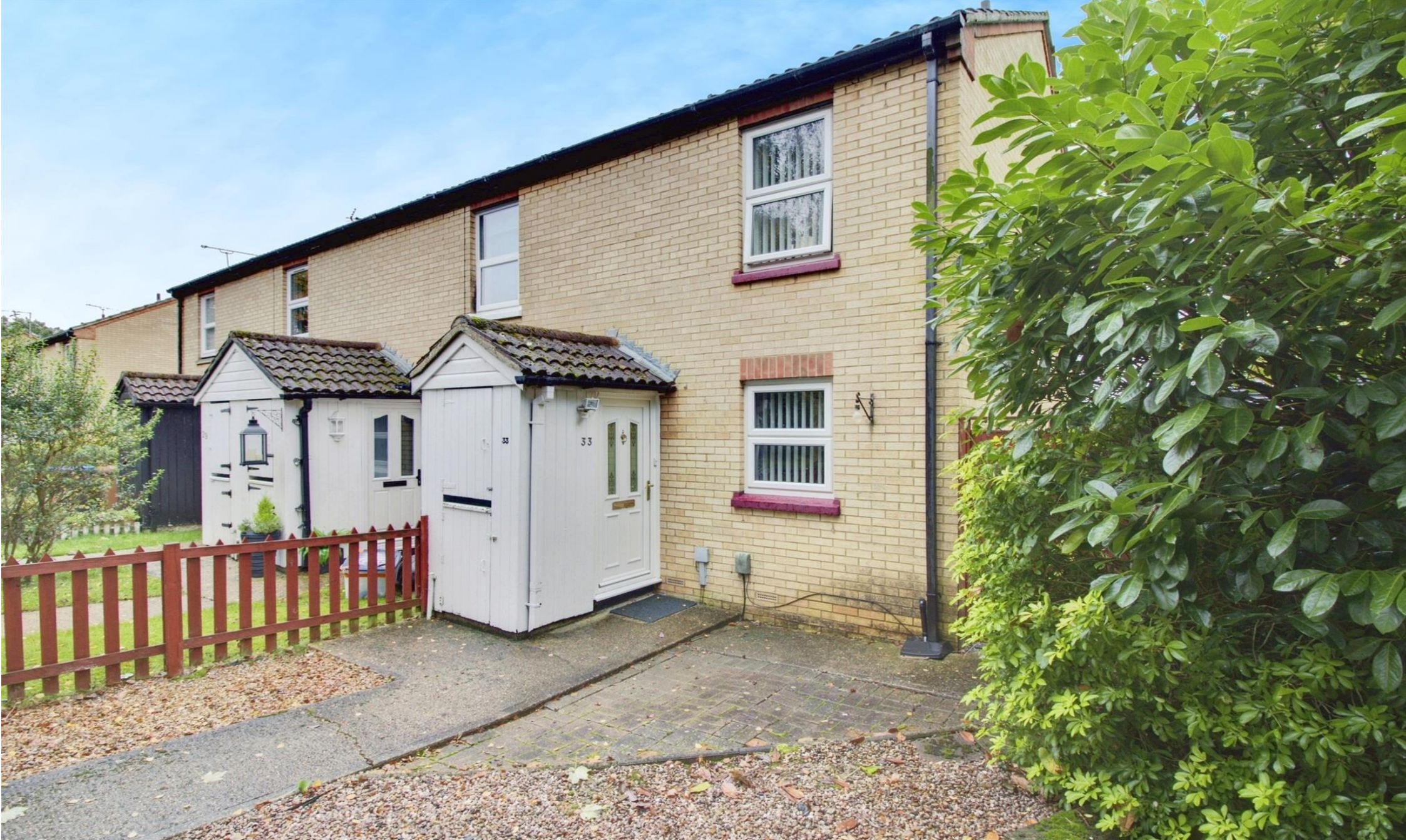
Ethelred Close, WELWYN GARDEN CITY AL7 3QF