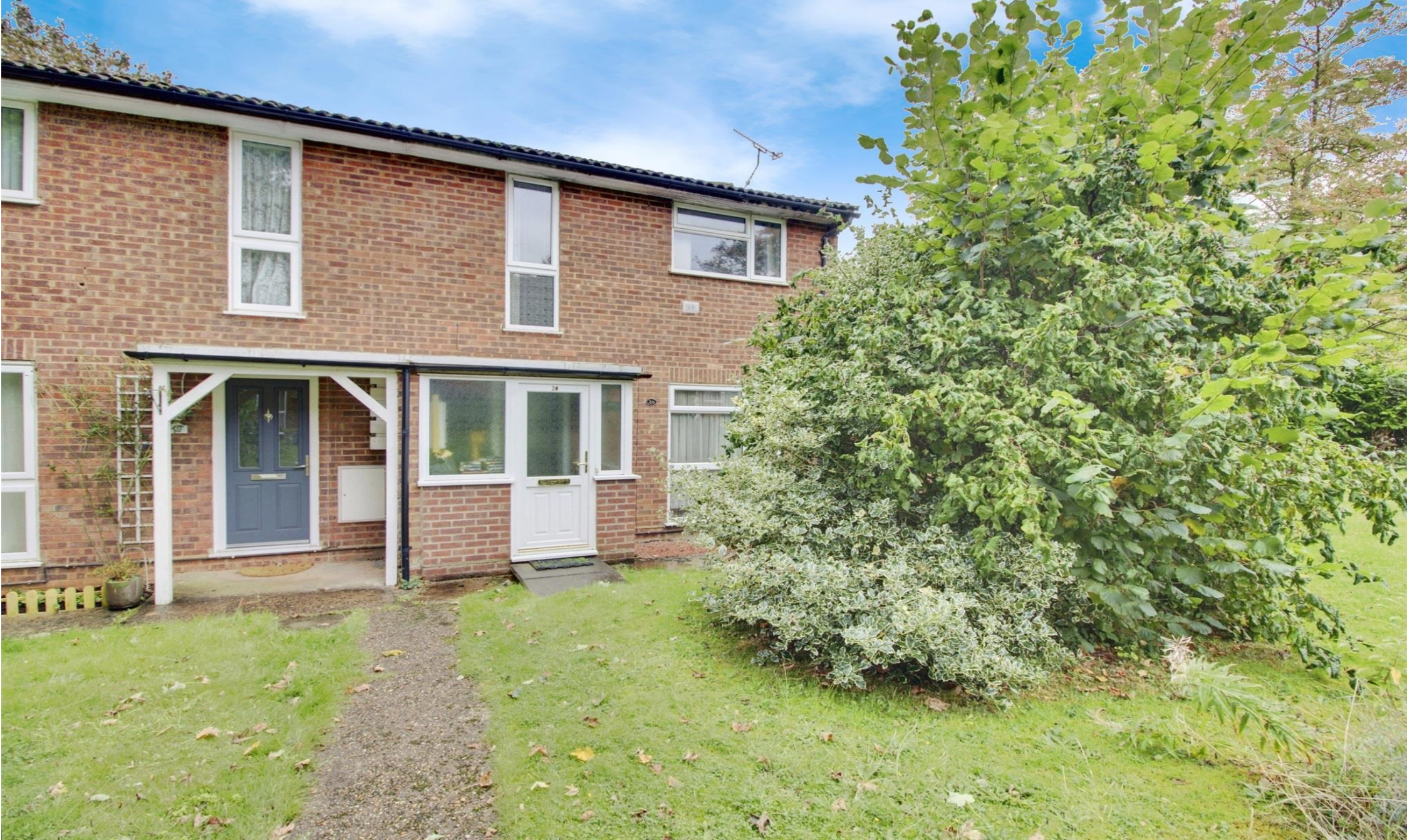
Nursery Gardens, Welwyn Garden City AL7 1SF