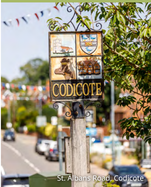
St. Albans Road, Codicote