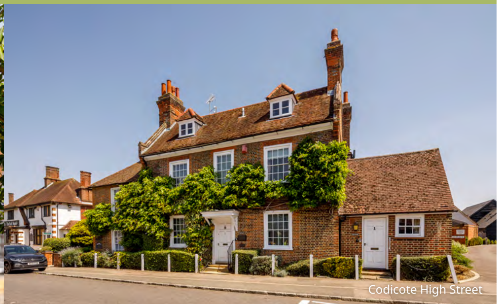
Codicote High Street