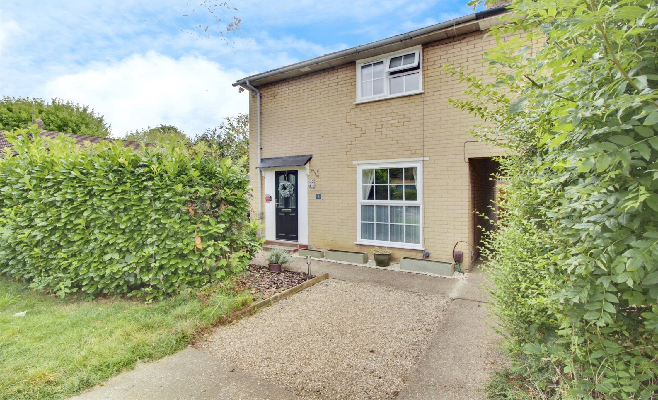
Little Lake, Welwyn Garden City AL7 4RT