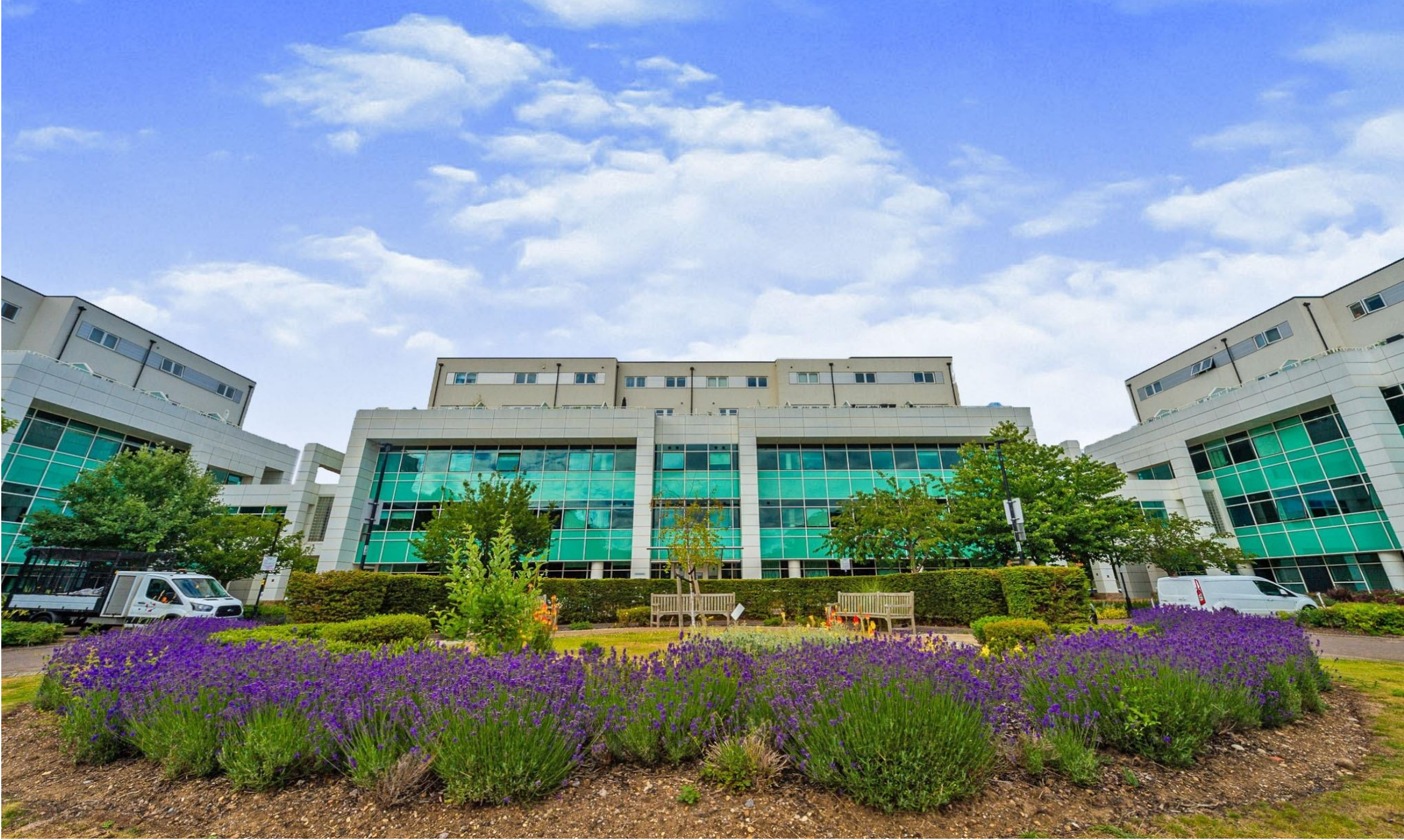
Empire House, Bessemer Road, Welwyn Garden City AL7 1FY