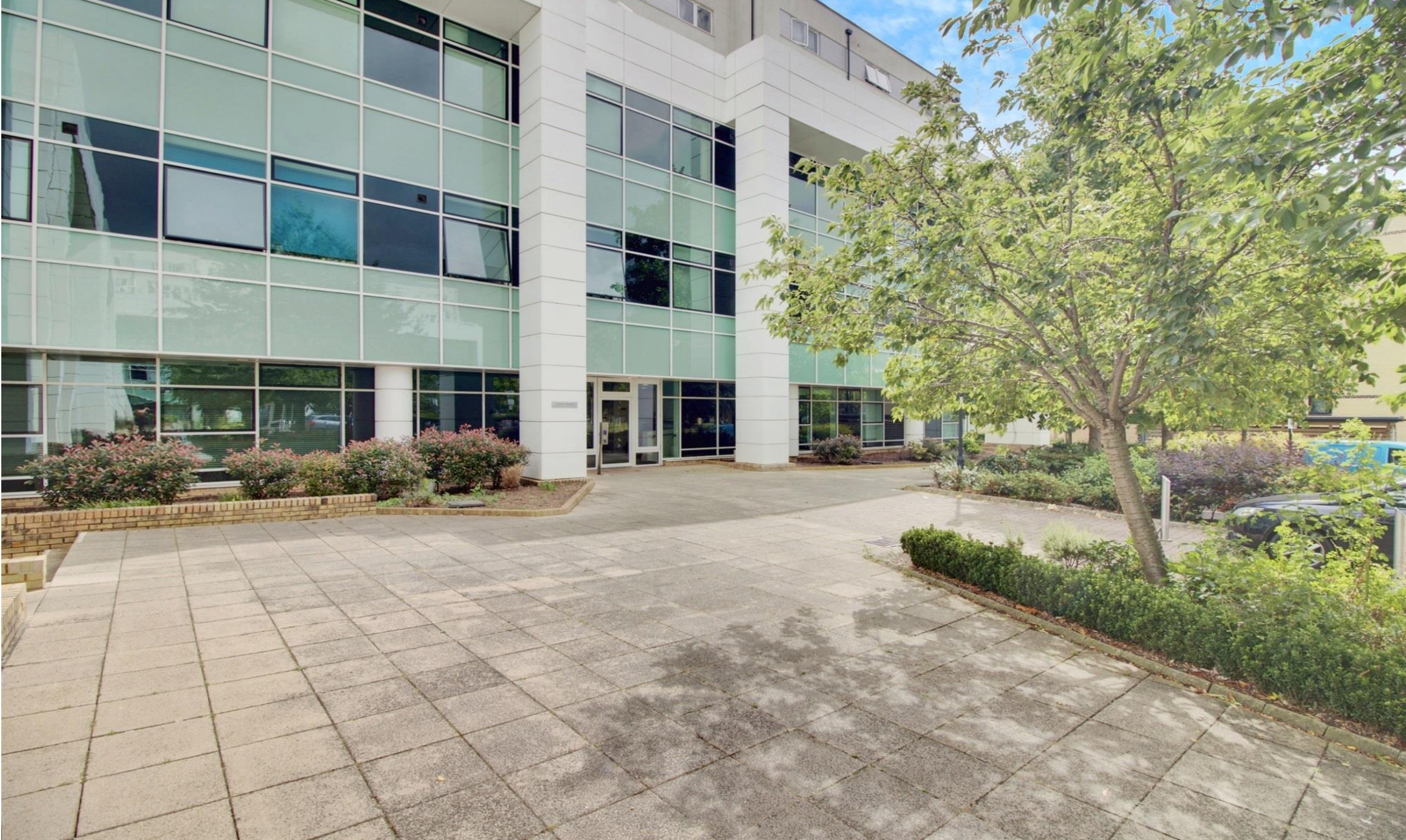
Liberty House, Bessemer Road, Welwyn Garden City AL7 1FU