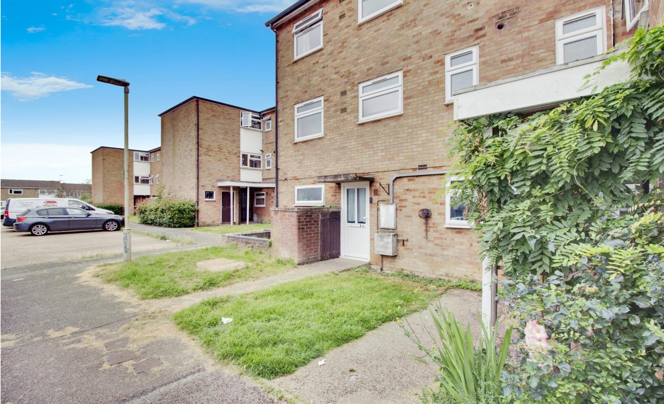
Nettlecroft, Welwyn Garden City AL7 2DW